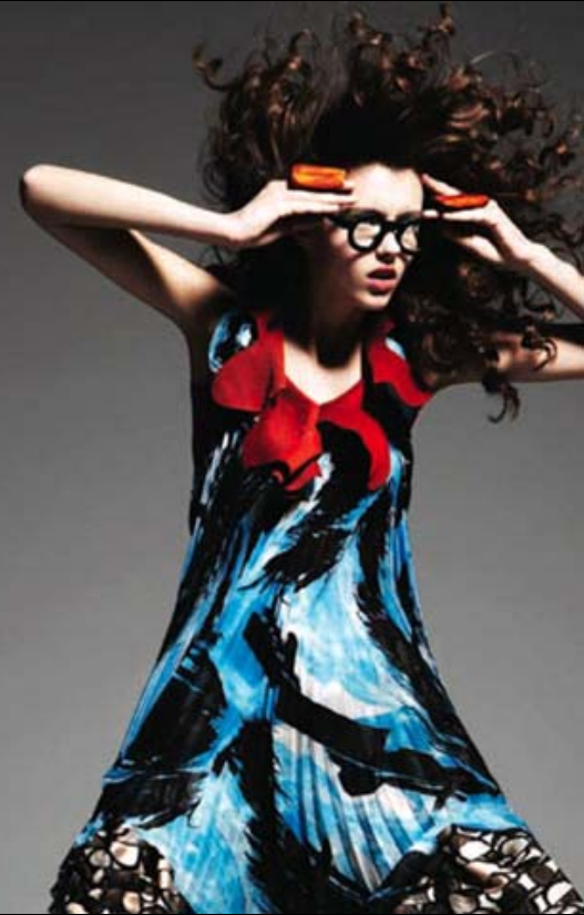
Publication: Plaza magazine Issue: June 2008 Feature: Fashion editorial – bone rectangle earrings, oversized tinted bone rings