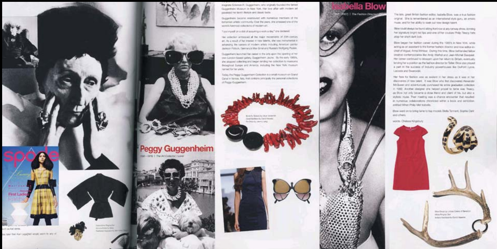
Publication: Spade magazine Issue: October 2008 Feature: Fashion's first ladies – red coral and horn necklace;; shed antler tips necklace