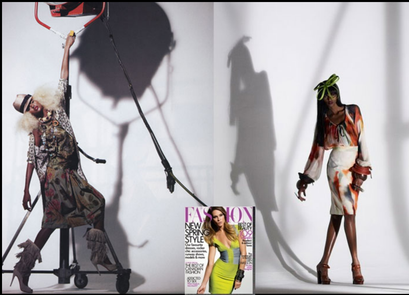
Publication: Fashion magazine Issue: February 2009 Feature: Canadian Club – best of Canadian fashion – orange croc ring; brown croc ring; natural fiber bangles (in black and brick colors); coconut cuffs; two oversized raw horn rings