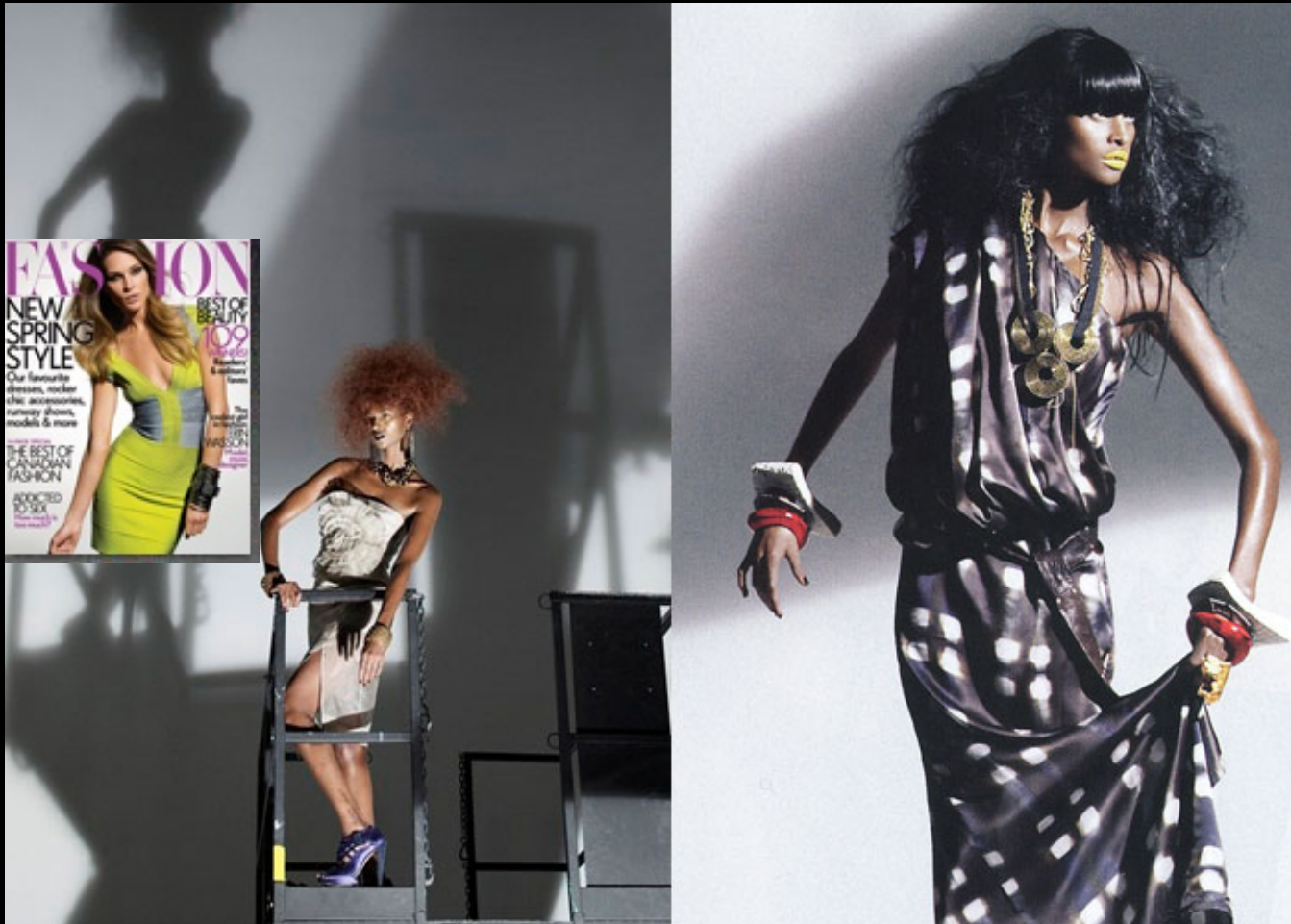
Publication: Fashion magazine Issue: February 2009 Feature: Canadian Club – best of Canadian fashion – oversized horn earrings; real croc white cuffs