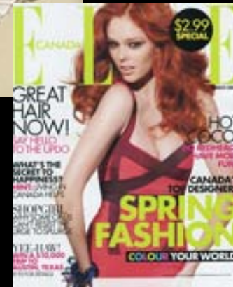
Publication: Elle magazine Issue: March 2009 Feature: Spring celebration – Best of Canada's fashion – crocodile bracelets and rings; natural fibre bangle