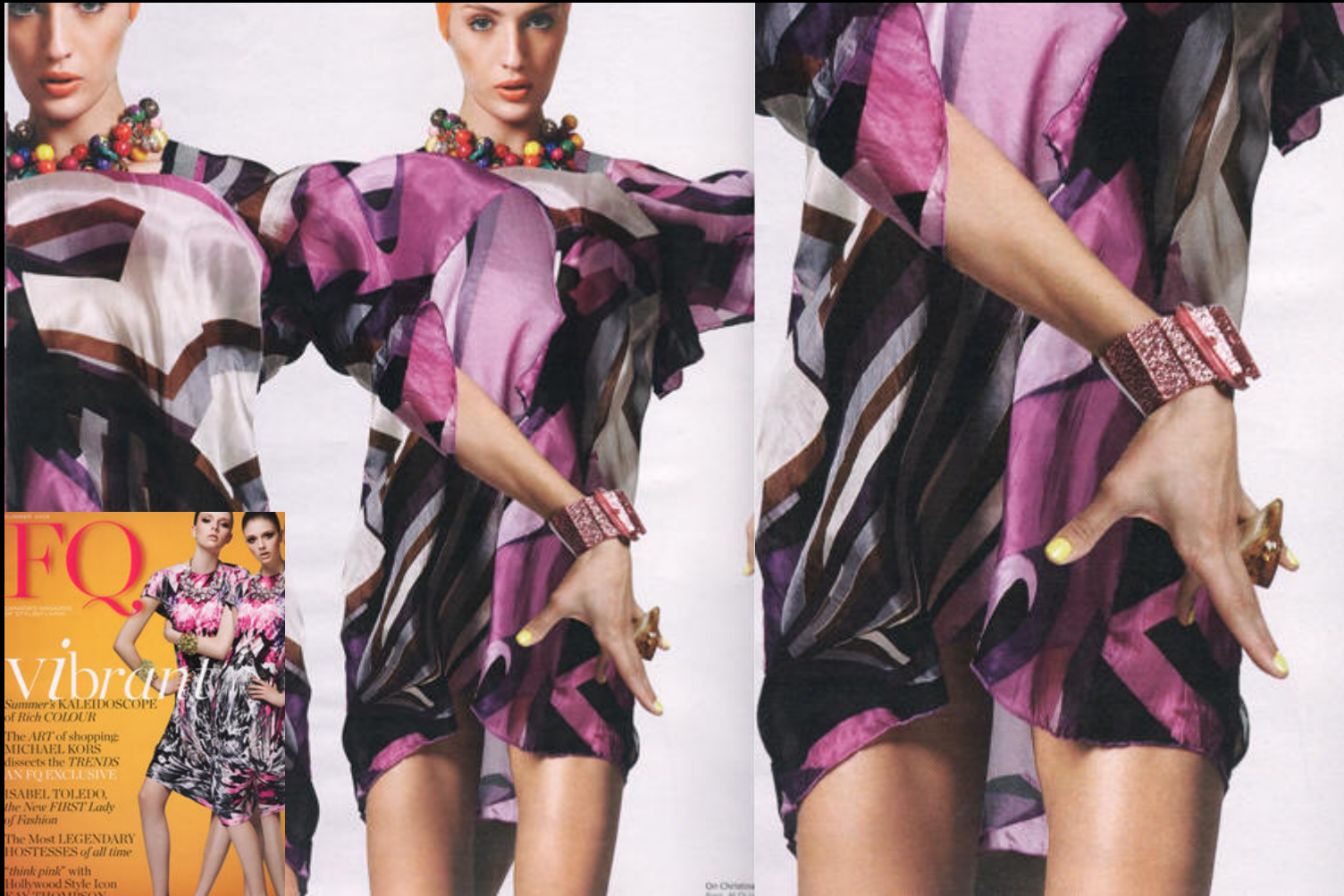
Publication: FQ magazine Issue: Summer 2009 Feature: KALEIDOSCOPE OF COLOUR – oversized amber ring