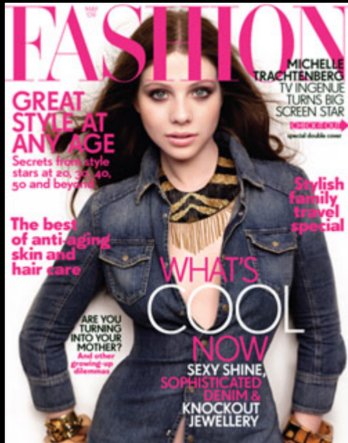
Publication: Fashion magazine Issue: May 2009 Feature: BEACH COMBER – oversized horn earrings and unique horn ring