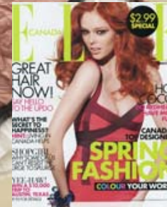
Publication: Elle magazine Issue: March 2009 Feature: SPRING CELEBRATION – BEST OF CANADA'S FASHION – crocodile bracelets and rings; natural fibre bangle