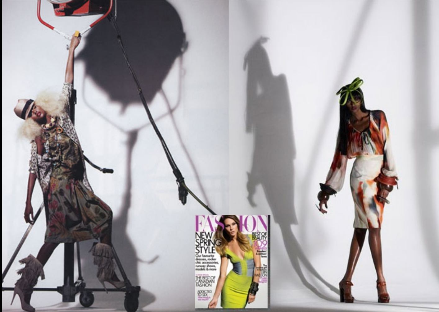
Publication: Fashion magazine Issue: February 2009 Feature: CANADIAN CLUB – BEST OF CANADIAN FASHION – orange croc ring; brown croc ring; natural fiber bangles (in black and brick colors); coconut cuffs; two oversized raw horn rings