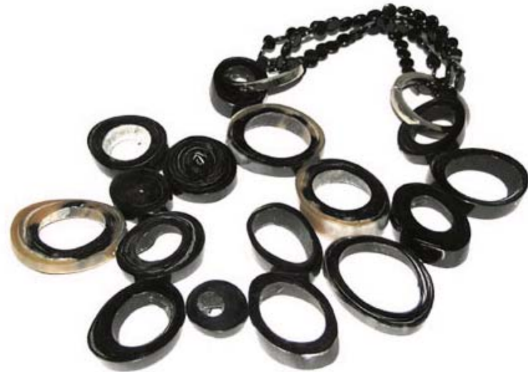
Publication: Elle magazine Issue: October 2008 Feature: BRIT IS THE NEW GLAM IN JEWELS – changing horn necklace with rings and beads