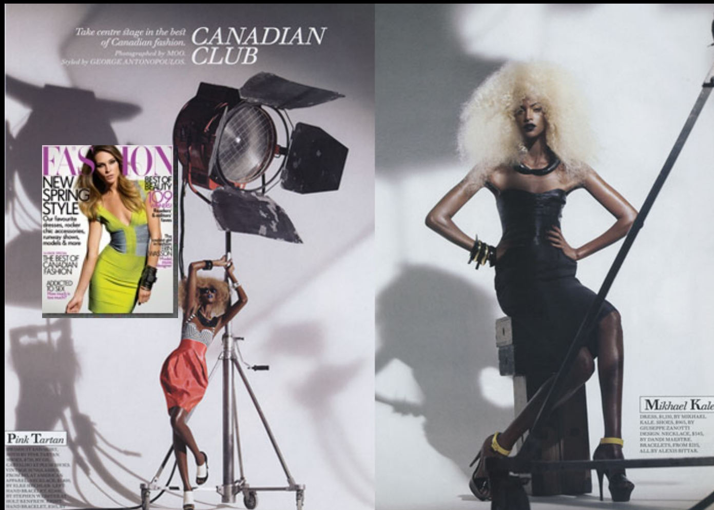
Publication: Fashion magazine Issue: February 2009 Feature: CANADIAN CLUB – BEST OF CANADIAN FASHION – huge horn tip necklace