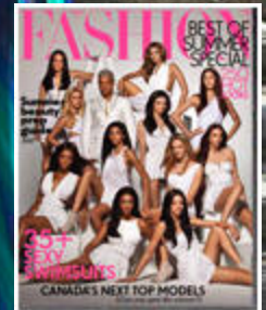
Publication: Fashion magazine Issue: June 2009 Feature: TRAVEL AND LEISURE – horn tips necklace; oversize horn tip key ring on leather