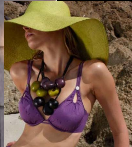
Window: Shan store in Toronto, Catalog: Shan 2009 catalogue – bone rectangle earrings, bone ring, tagua necklaces