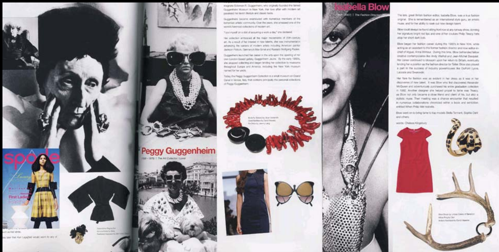
Publication: Spade magazine Issue: October 2008 Feature: FASHION'S FIRST LADIES – red coral and horn necklace;; shed antler tips necklace