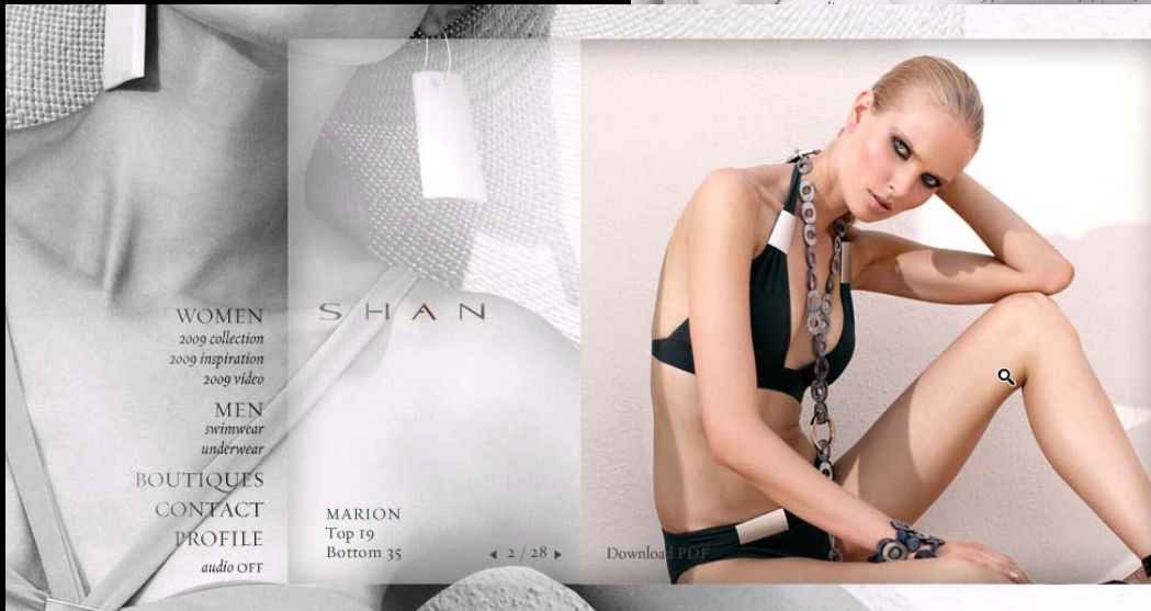
Publication: Shan swimwear website and catalogue -Collection 2009 – shell long necklaces; bone rectangle earrings, bone rings and more in photos from 2009 Catalogue for Shan